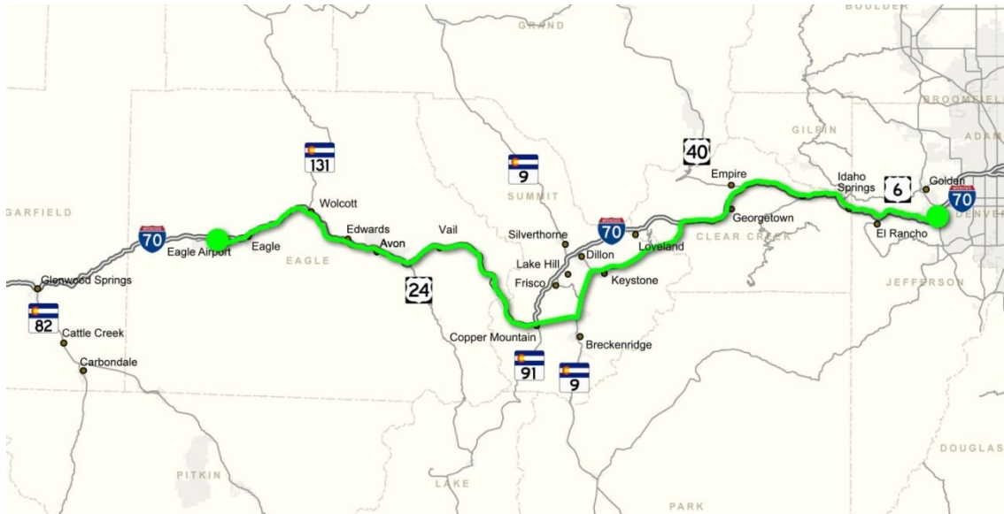
Figure ES-3: Hybrid Alignment