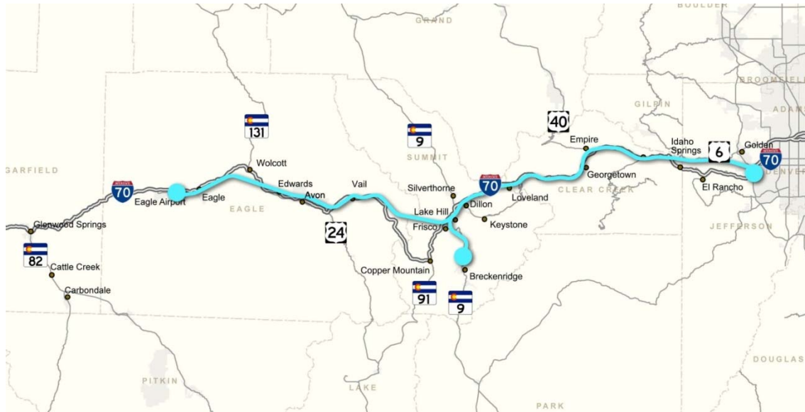
Figure ES-1: High Speed Rail Alignment