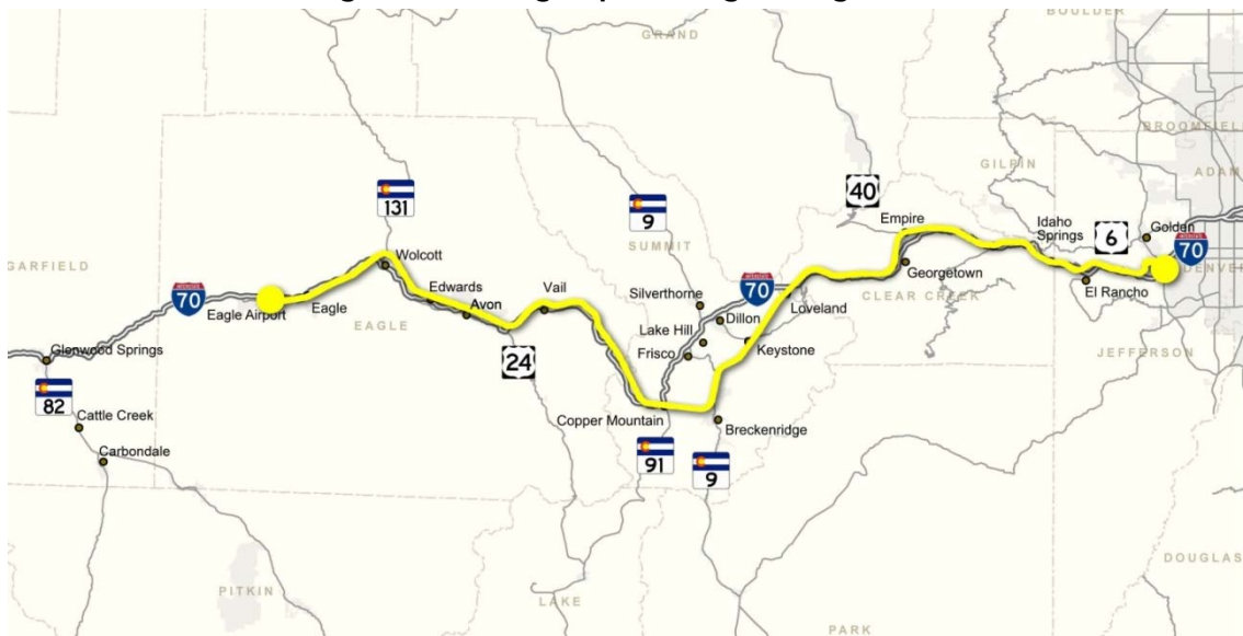
Figure ES-2: High Speed Maglev Alignment